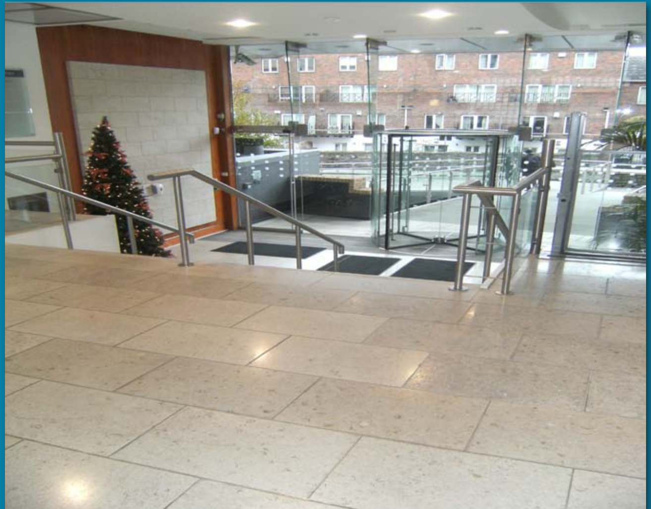
Watermarque Reception Area