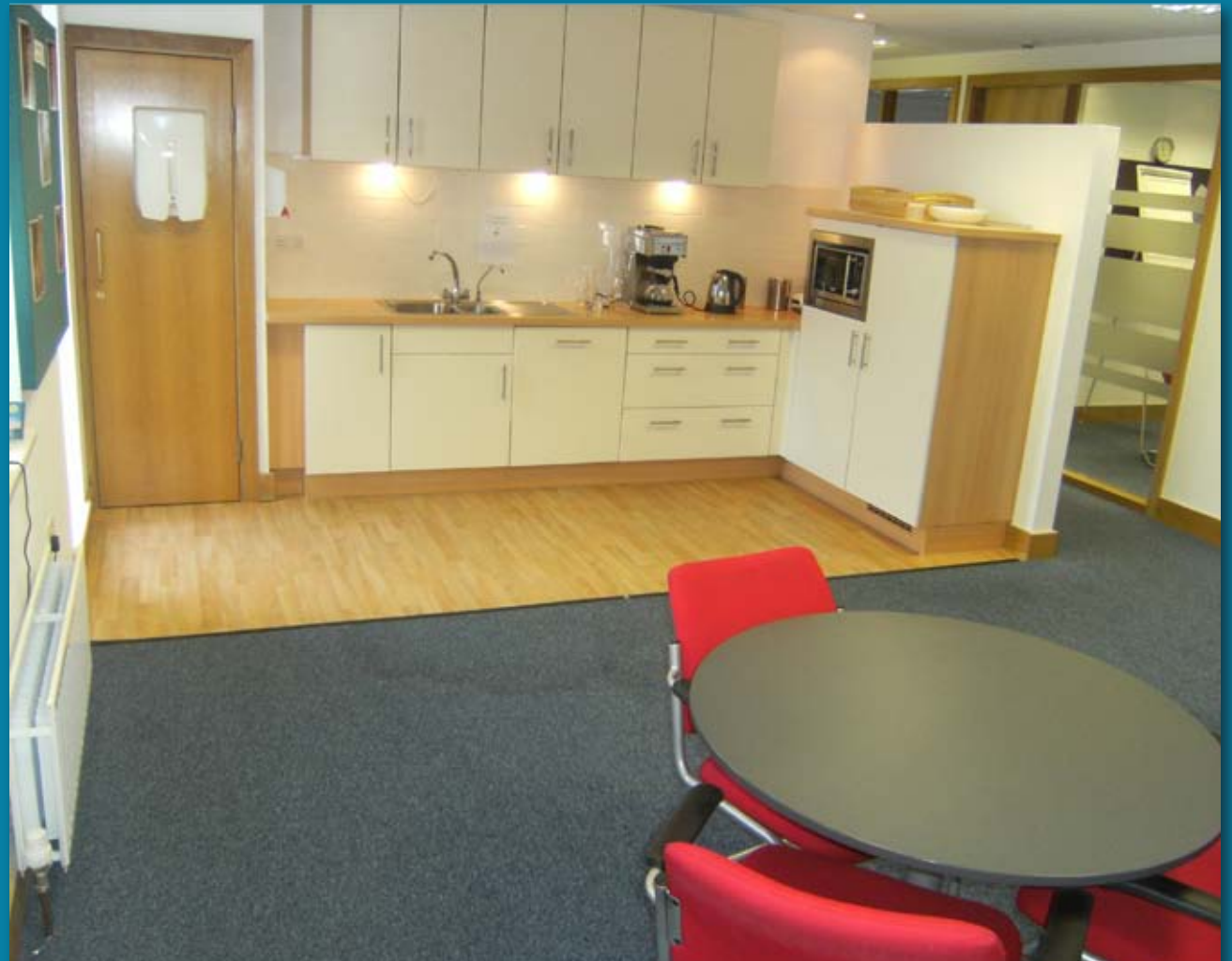
Albert Place Canteen, 2nd Floor