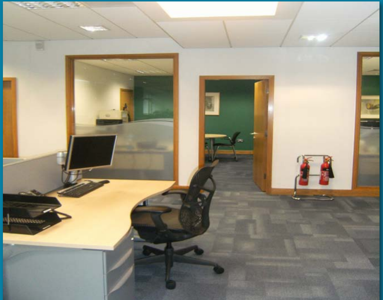
Iveagh Court, Block D