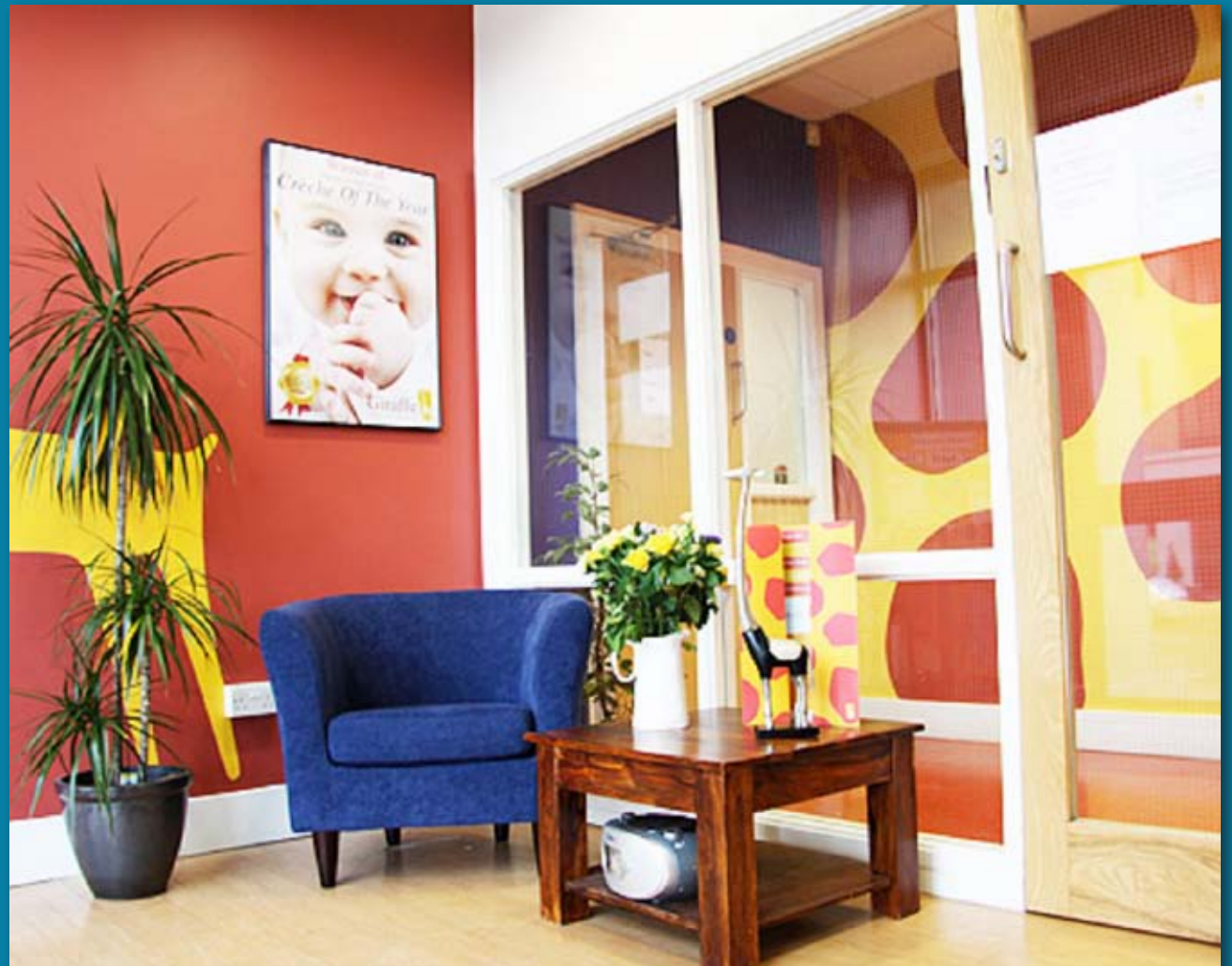
Giraffe Childcare and Early Learning